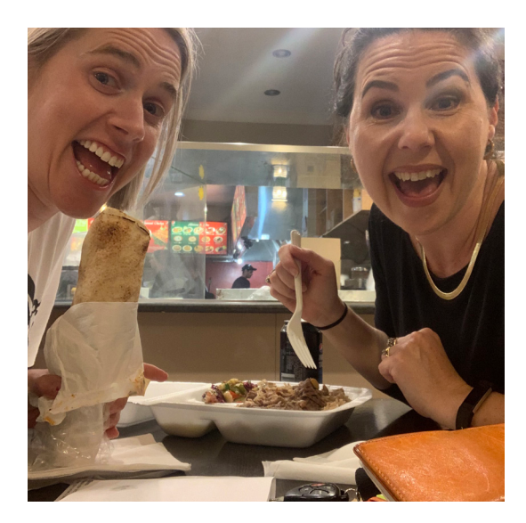
Celebrating Tiny Works over a kebab

"What was extra special about Tiny Works, is the opportunity for every student to contribute their ideas during development process and also have the chance to showcase their own particular strengths in each bespoke performance. Developing your students to a level whereby they can maturely interact with an adult audience while still delivering a high quality performance is a credit to your teaching and preparation of the students. The ability to perform in site-specific surroundings while engaging with the audience is a task I have seen many Year 12's (and adults) struggle with - I had to keep reminding myself these students were Year 9! Tiny Works is a unique, original performance which is clearly a culmination of three years of dedication and hard work by all those involved in SVAPA"