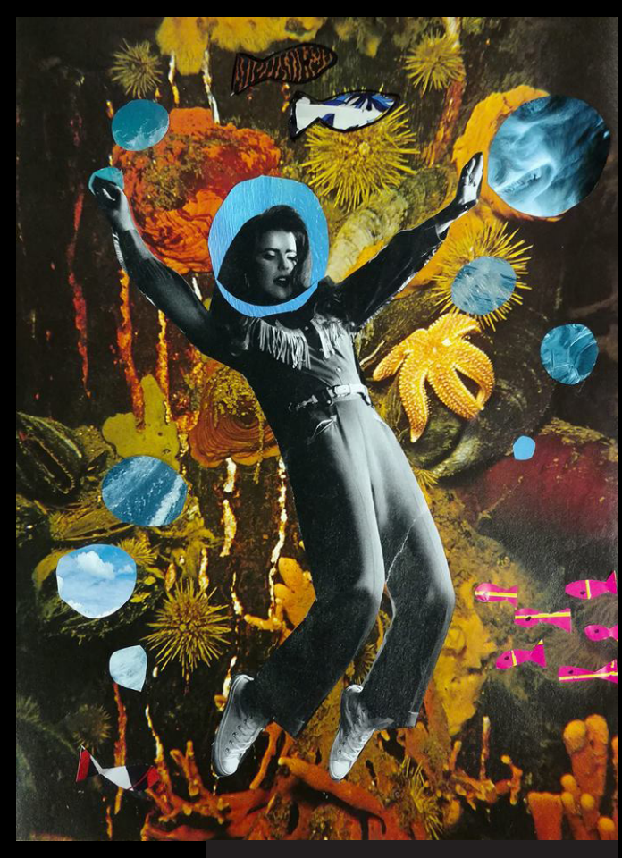
Year 9 Early Morning Class