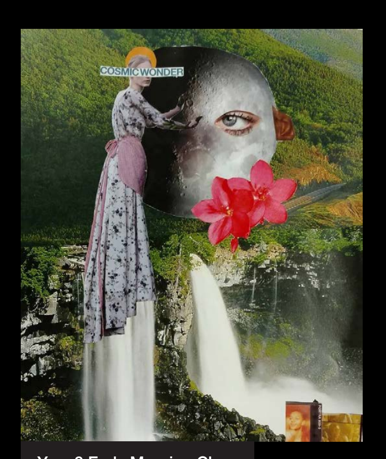
Year 9 Early Morning Class

You can also help by attending the function. It's a great evening, with food and wine, that connects us as a community in Mount Lawley. The event is on the 15th of June. Please check the school website for further information.